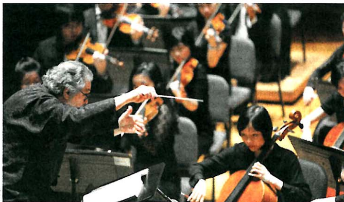
The Conservatory Orchestra conducted by Peabody faculty and pianist Leon Fleisher, the Conservatory's Ong Teng Cheong Distinguished Visiting Professor in Music 2008-09.

In recent years, Singapore has also invested heavily in developing into a global city for the arts, with NUS and its partners forming much of the driving force. In 2001, the