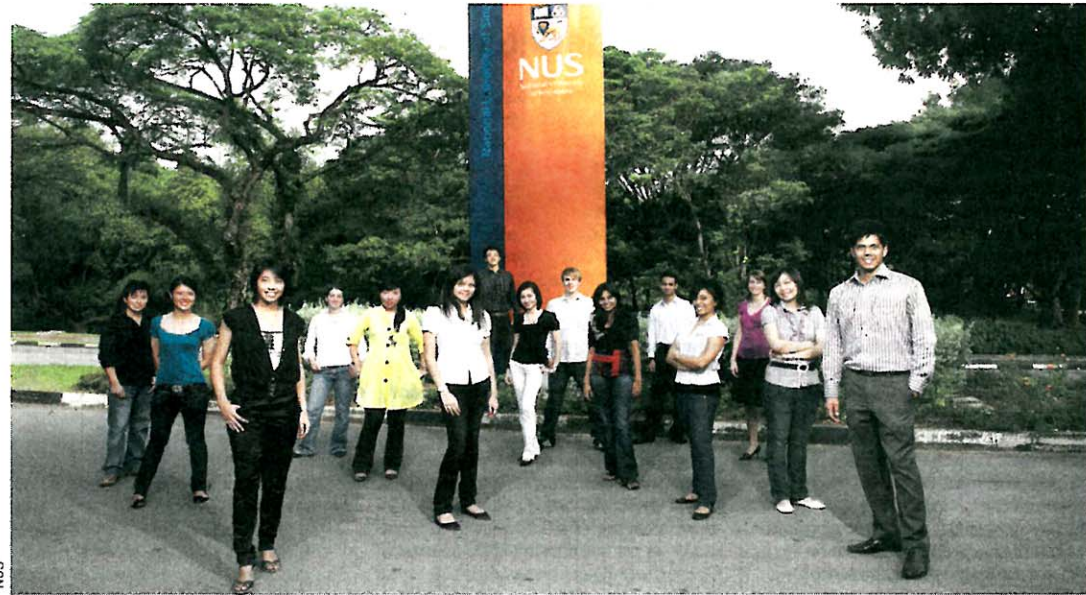
The university's global atmosphere is reflected in its international student body.

Producing high-impact, cutting-edge research is another area of focus, with the university playing pivotal roles in a number of research centers and alliances, including the nationally funded Research Centers of Excellence (RCEs), the International Alliance of Research Universities and the Association of Pacific Rim Universities. A new NUS