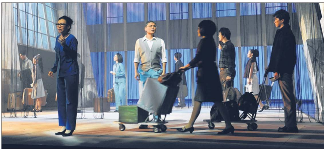
Sing it out: December Rains (above), Liao Zhai Rocks! (below left) and The Full Monty (below right) were three of the musicals that rocked the local theatre scene last year.

"I love using beautiful music to tell a story and I like the impact it has, which resonates in you for a